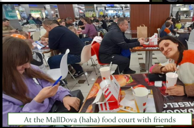
At the MallDova (haha) food court with friends