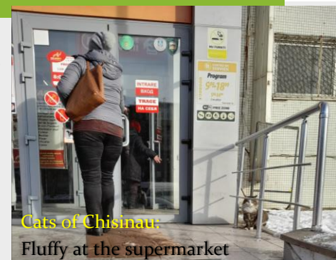
Cats of Chisinau: Fluffy at the supermarket