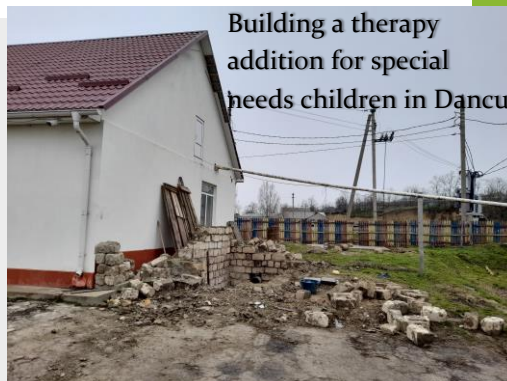
Building a therapy addition for special needs children in Dancu.